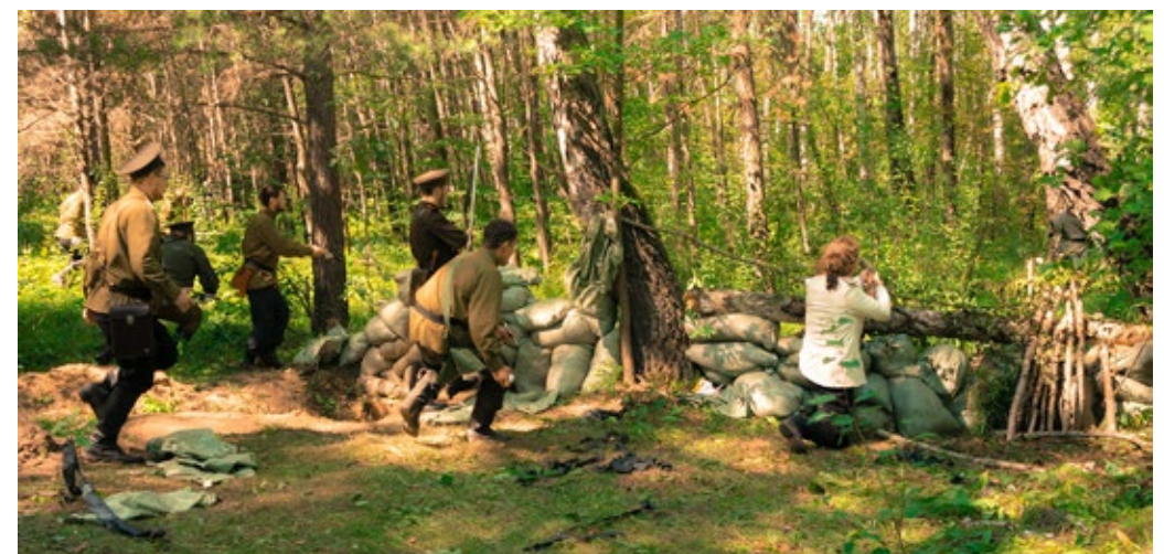
The sandbag front in Manchuria, with the Grand Prince Michael Alexandrovich far right.

One very exotic aspect, from a Nordic player's perspective, was the constant fast-tracking of time. In the larp, one day for the player was three months in-game. In this way, politics could speed for-